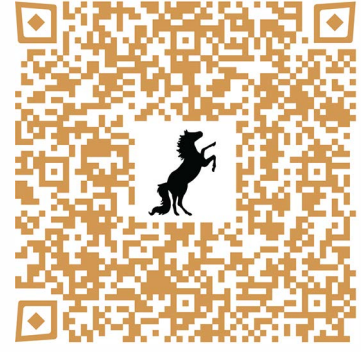
Register your interest here.